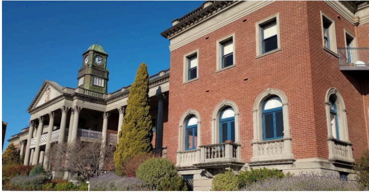
The original 1893 Heritage building.