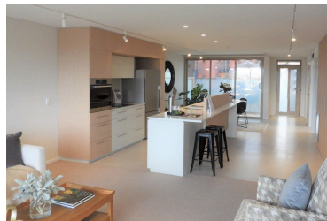
Open plan design